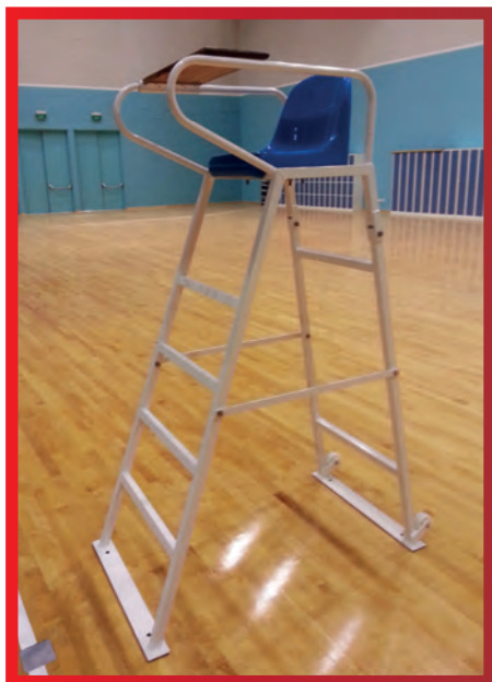
Badminton Umpire Chair, Power Coated

The badminton umpire chair is made from special aluminium profiles. The base is a ladder like structure from aluminium. It is protected on its ends with rubber. This allows a safe you on any playing surface.