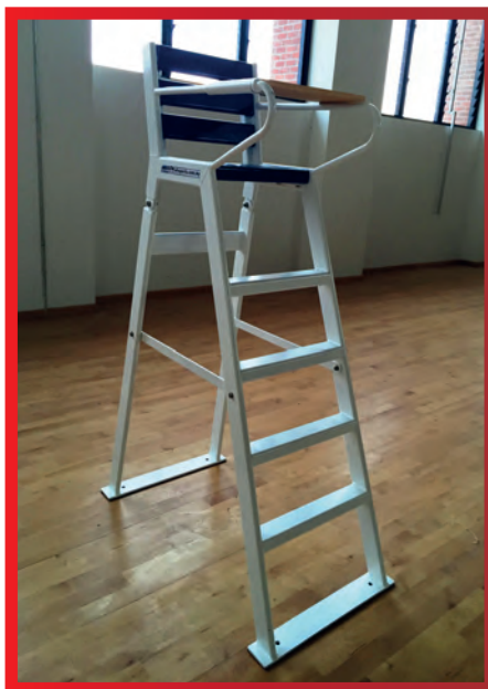
Badminton Umpire Chair, 'Deluxe'

The badminton umpire chair is made from special extra sturdy aluminium profiles. The structure of the chair is made from 90x25 mm rectangular profiles with specially rounded edges. The steps are realized with a special shaped profile. All steps are equipped with an anti-slip surface. The structure and the seat are completely made from aluminium.